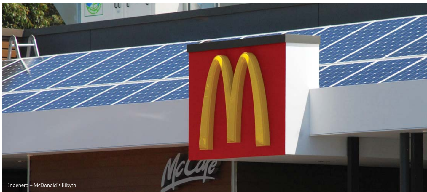
Ingenero – McDonald's Kilsyth

If you are unable to install solar PV panels on your building but wish to source part of your business's electricity from renewable sources, then you should explore GreenPower options greenpower.gov.au